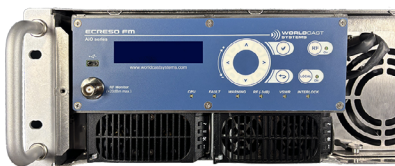
Up to 2 hot swappable 3.5kW PSUs