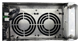
2 hot swappable Fans