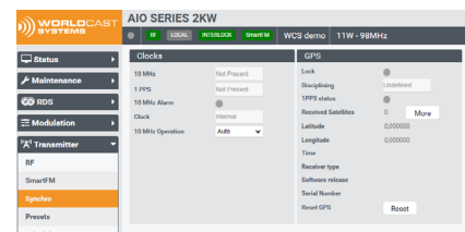
GPS receiver configuration