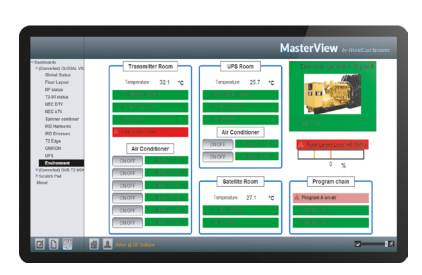
MasterView Remote Customised view(s)