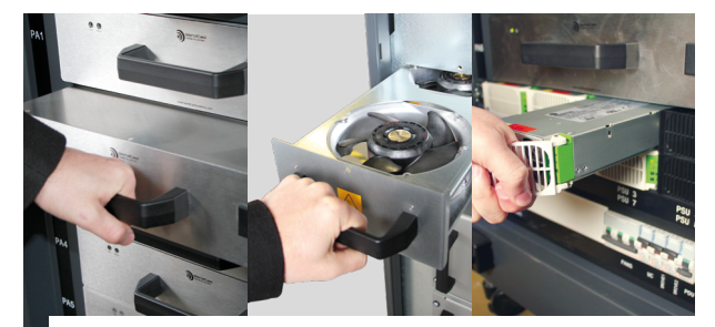
Redundant & Hot-swappable Power Supplies, Power Amplifiers and Fans