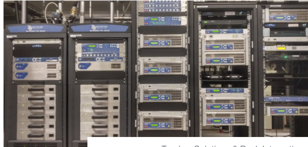
Turnkey Solutions & Rack Integrations