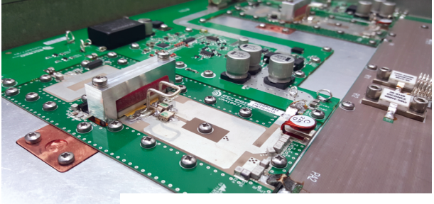
6th Generation MOSFET & Planar Design