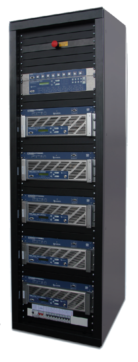
4+1 Ecreso FM 350W